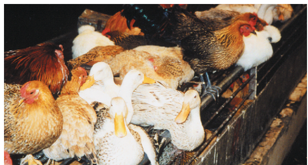
Figure 1: Poultry wet-market in mainland China

The H5N1 bird-influenza incident in Hong Kong in 1997 left no doubt about the role of live-poultry markets as a source of novel infectious disease agents for human beings. Live-poultry markets were identified as a risk factor for H5N1 influenza, 8 and slaughter of all poultry in Hong Kong brought the outbreak in human beings to a stop. To reduce the possibility of re-emergence of H5N1, changes were